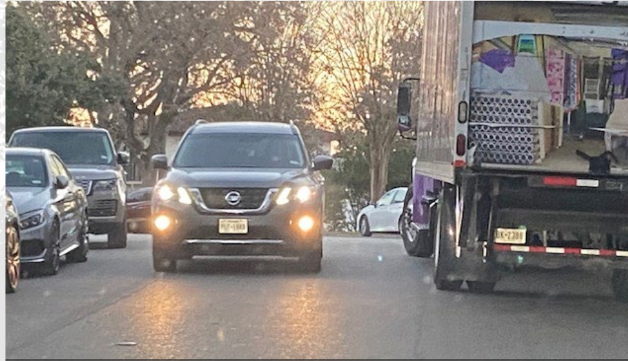
Delivery trucks for set up of events, impeding flow of traffic

TRUCKS, VALETS & RIDESHARES will CONTINUE to IMPEDE the FLOW of TRAFFIC on our RESIDENTIAL STREETS