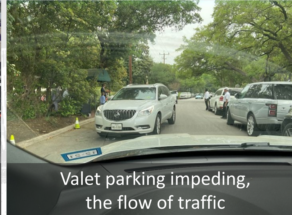
Valet parking impeding, the flow of traffic